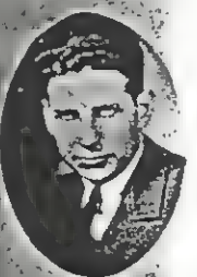
Dean Hammack Dry Cleaning